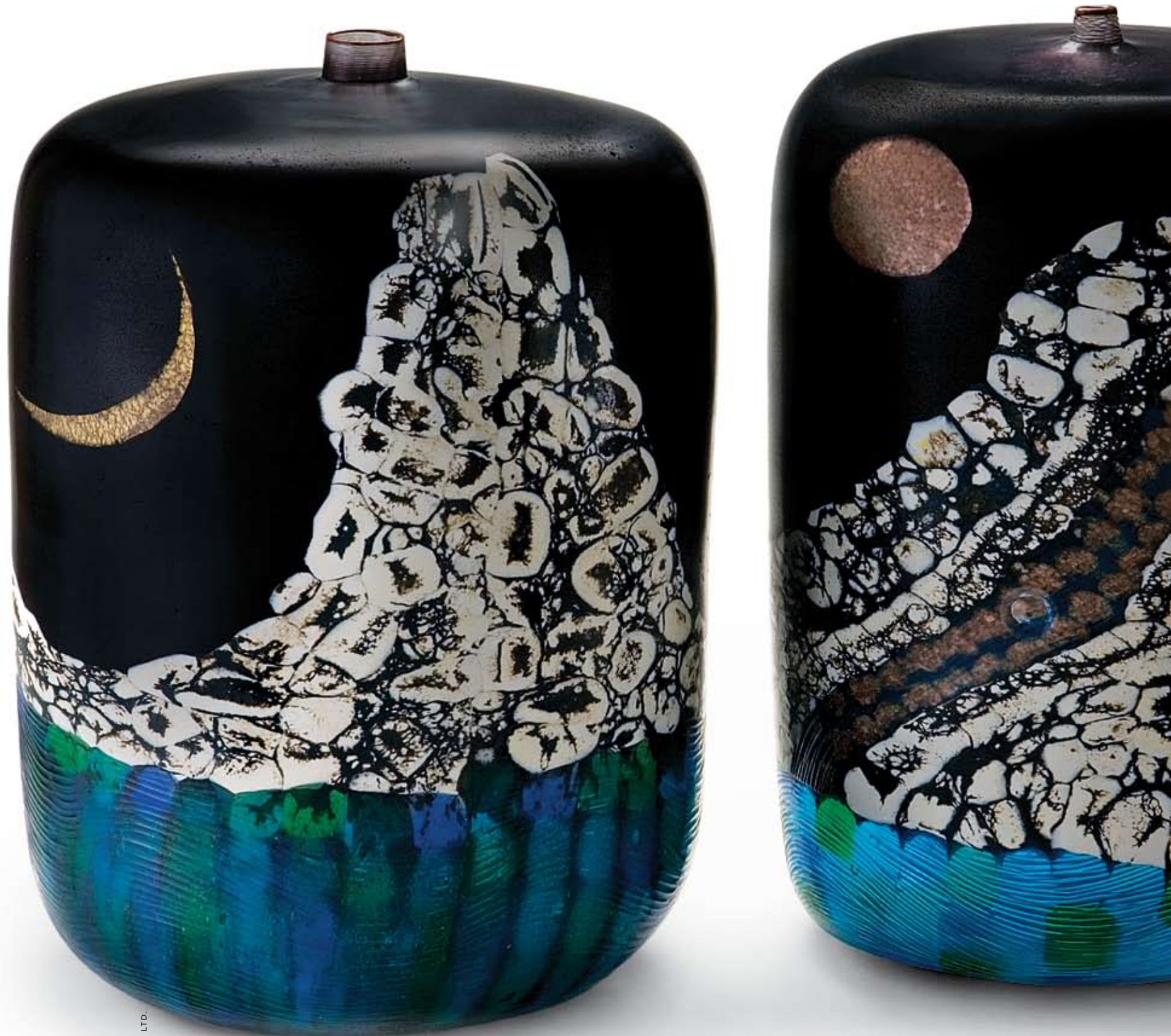
BARRY FRIEDMAN LTD.